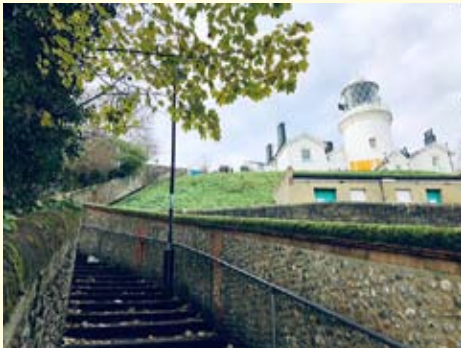
© Colin Butler - Sparrows Nest