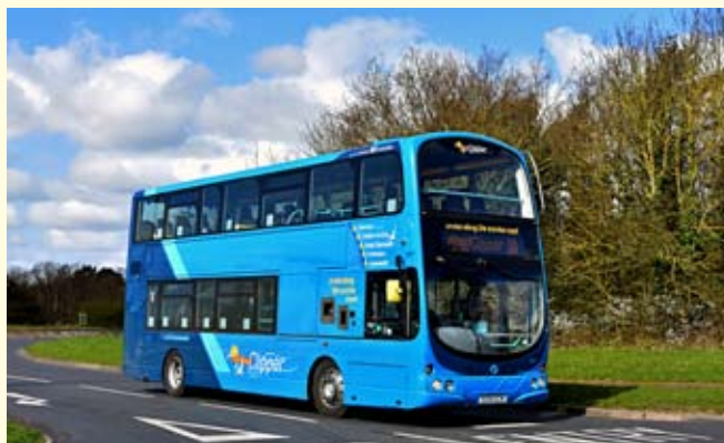
Bus along the coast

Lowestoft has existed for over 1,000 years and the old High Street dates back at least half that time; but it was the coming of the railway and development of the harbour which led to the rapid development of the town and its resort area, thanks to Sir Samuel Morton Peto. You can find out more about this Victorian entrepreneur by looking in archway number 5 on the south wall of the station.