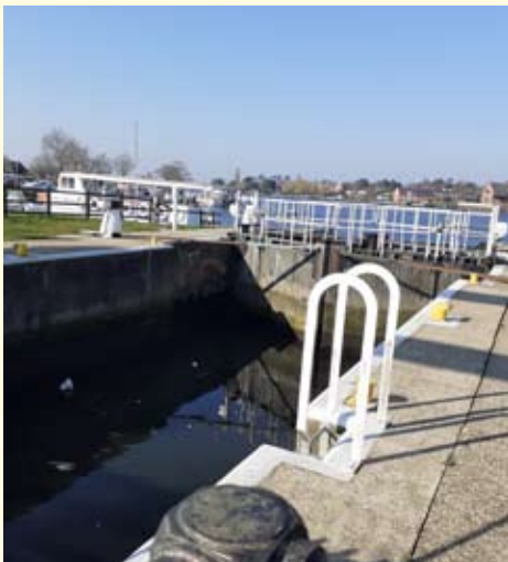
Mutford Lock