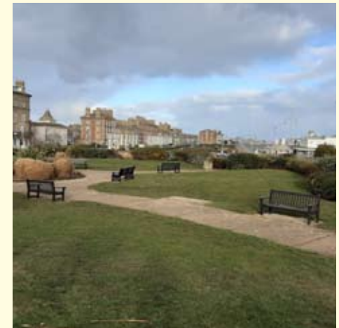
© Colin Butler - Twinning Garden & Pakefield Beach (front cover)

Published by the East Suffolk Travel Association (ESTA), April 2024.