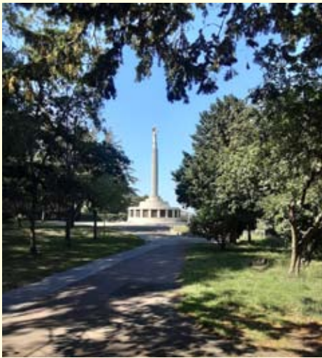
© Colin Butler - RNPS Memorial, Belle Vue Park